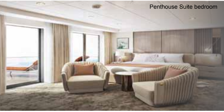
Penthouse Suite bedroom