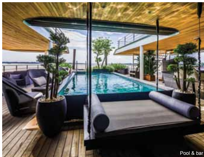
Pool & bar