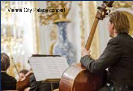
Vienna City Palace concert