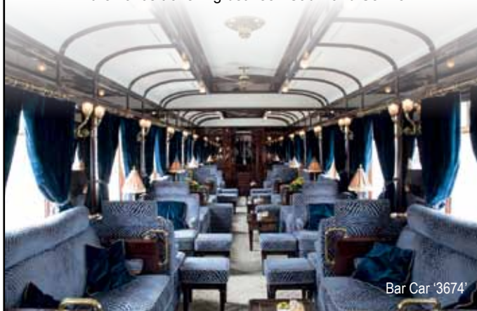
Bar Car '3674'

This spellbinding carriage was built in 1926 in England and showcases exquisite marquetry. It ran with the opulent Etoile Du Nord train from Paris to Amsterdam. Following this, it ran Lisbon to Madrid with the Lusitania express, before finishing in the 1970s travelling between Cádiz and Seville.