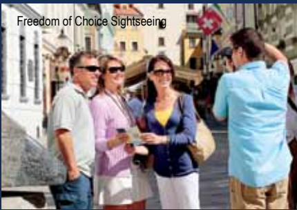
Freedom of Choice Sightseeing