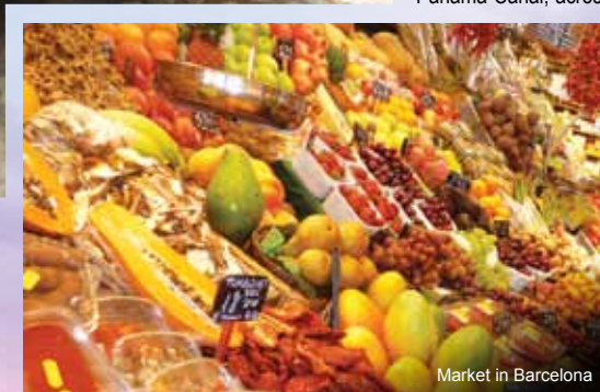
Market in Barcelona