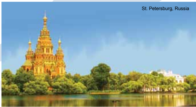
St. Petersburg, Russia