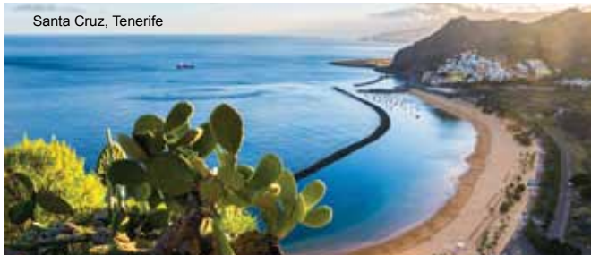
Santa Cruz, Tenerife

JUST A DEPOSIT REQUIRED TO SECURE YOUR PREFERRED CABIN