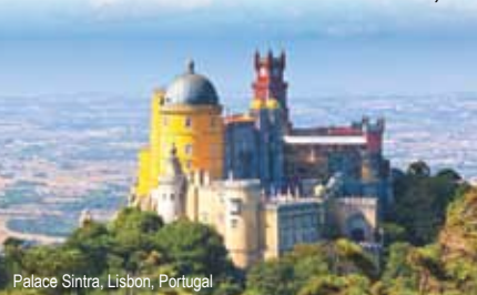
Palace Sintra, Lisbon, Portugal