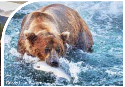
Grizzly bear, Alaska