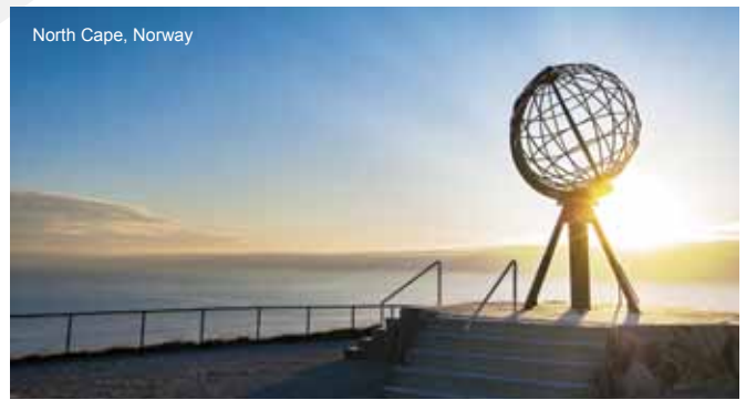
North Cape, Norway

Itinerary, prices and availability are based on 26 th July 2020 departure and itinerary may vary on other dates. 26 th July 2020 is a multi-generational cruise