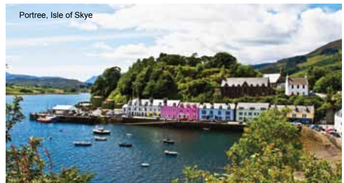
Portree, Isle of Skye

for cruises of 16 nights or more) will be debited to your on board account. †Based on 18th December 2019 departure. ‡Based on 18th December 2019 & 26th July 2020 departures. of business apply. Please see back page for full terms and conditions.