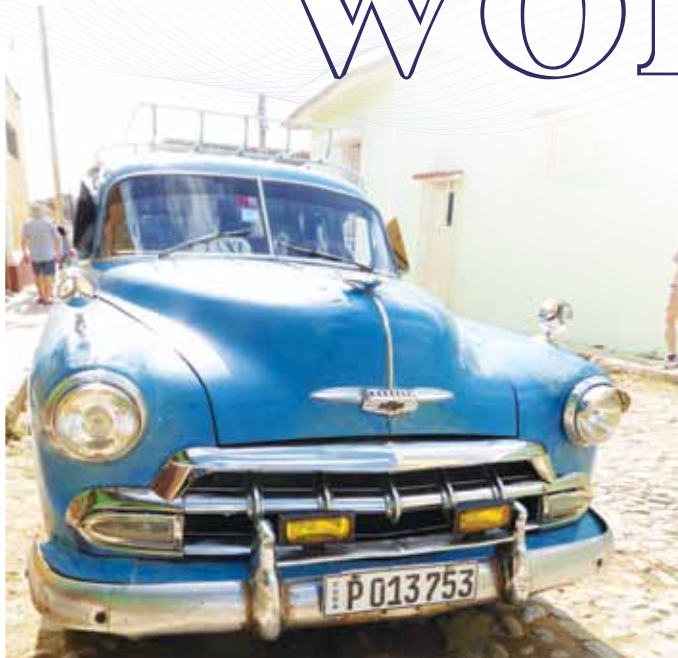
1950s car in Cuba

Work commitments make it impossible for me to get away for several months at a time on a world cruise. But I'll do it one day. Why? Because like every cruiser – and even some folk who have never even set foot on a ship – it is the ultimate journey by sea.