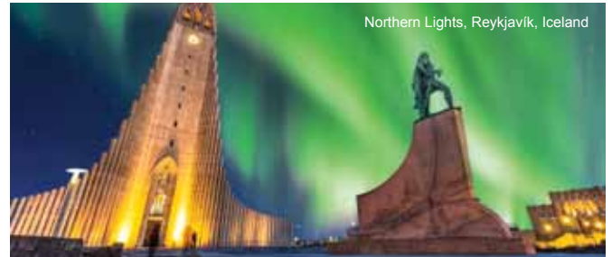
Northern Lights, Reykjavik, Iceland